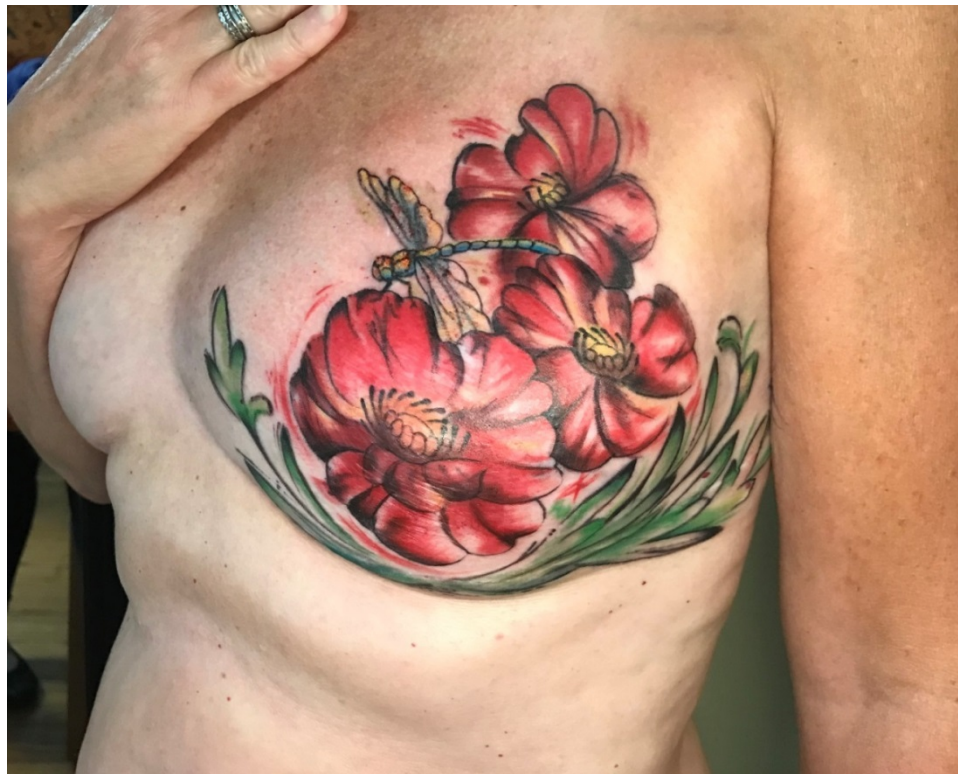
Figure 1. Unilateral Watercolor Floral Mastectomy Tattoo.

Traditional body artists are able to offer designs that complement the new landscape of a woman's postsurgical breasts. Clients are provided with bolder body art design options as opportunities for artistic expression to further their recovery. The possibilities are endless to fit new contours and camouflage scars. The tattoo designs are expansive, ornate, and organic (as seen in figure 1) to best fit the flow of a woman's body, and they can be used to pull an observer's eye away from surgical scarring, skin puckering, and asymmetry. With these options available, a woman can use a tattoo creation to embolden her sexuality and self-confidence. Awareness of these alternatives seems to have been spread by various nonprofit groups, including on their social media pages [3].