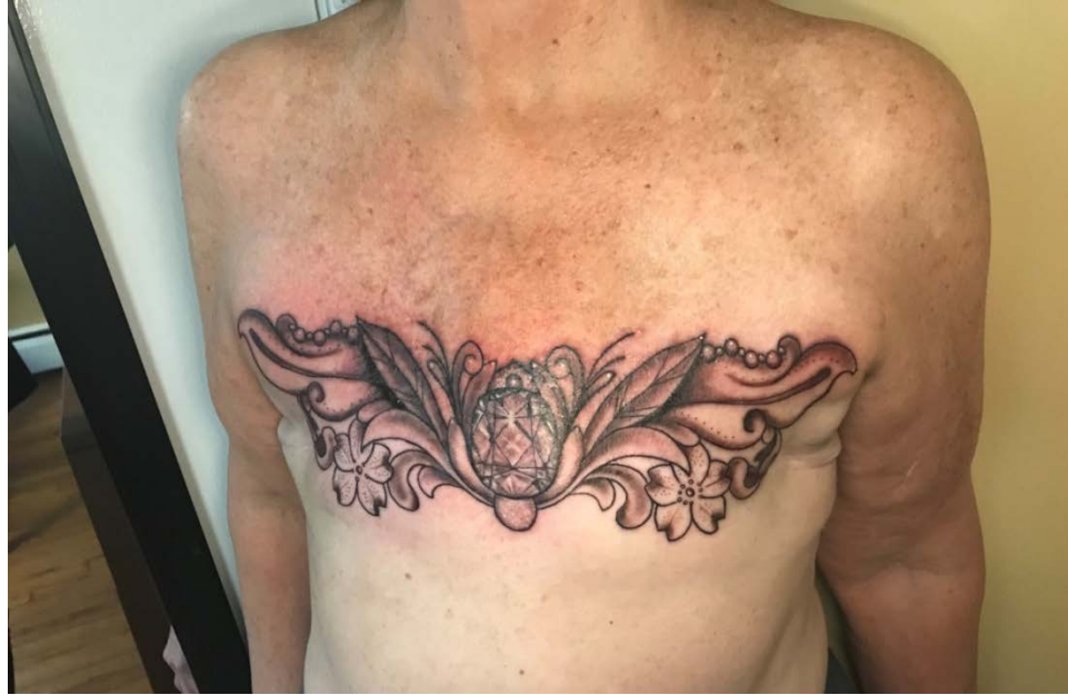
Figure 3. Black and Gray Ornamentation Mastectomy Tattoo on Unreconstructed Chest.