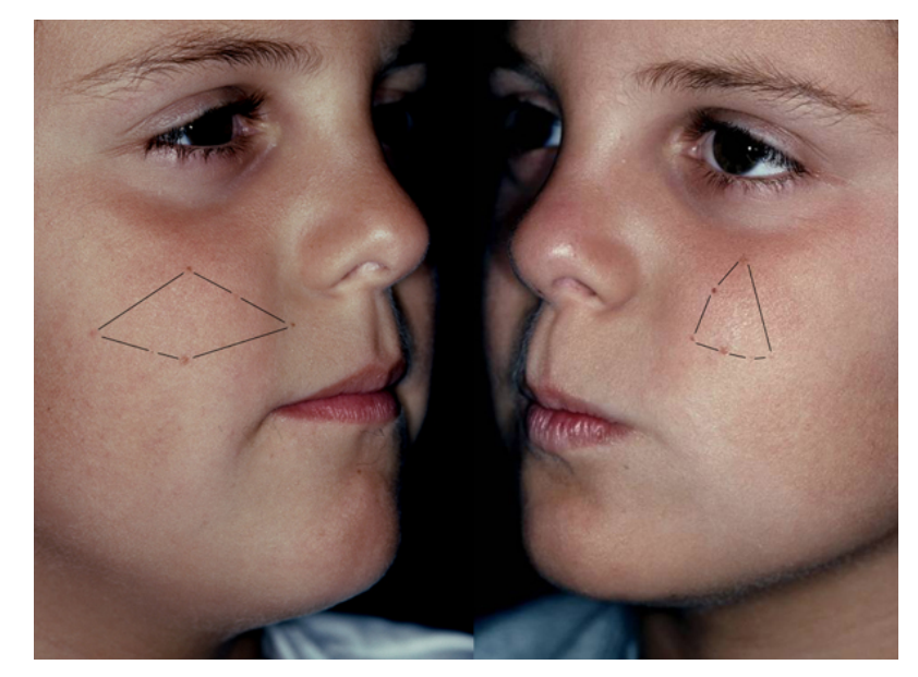
Figure 2. Both twin A (left) and twin B (right) exhibit a polygon of nevi only on opposite cheeks. It is likely that different rates of embryologic tissue transit account for the slight differences in the shapes of the polygonal arrangement in each twin, although both clusters remain within the boundaries of the anatomic region innervated by the second branch of the trigeminal nerve.

New digital addition and subtraction techniques used to analyze highly standardized images of twins can be employed to study facial shape for the presence of anatomic mirroring [3]. As in radiological techniques used for digital subtraction angiography, images of twin faces are overlapped and then digitally subtracted from each other to determine whether anatomic shape was concordant (present on the same side in both twins) or mirrored (present on the right side in one and left side in the other), as are the twins in figures 3 and 4 (next page). Analysis of 27 pairs of monozygotic twins showed that 64 percent of male pairs and 23 percent of female pairs exhibited the mirror phenomenon, and that there was no relationship between the mirror phenomenon and the timing of the first split of the egg in either gender [4]. When the appropriate side of the face was analyzed (i.e., either the same or opposite) in these same twins, nearly 100 percent of skin features were found to be present in both twins [5]. In light of these observations, all future studies of anatomic inheritance should control or consider the mirror phenomenon.