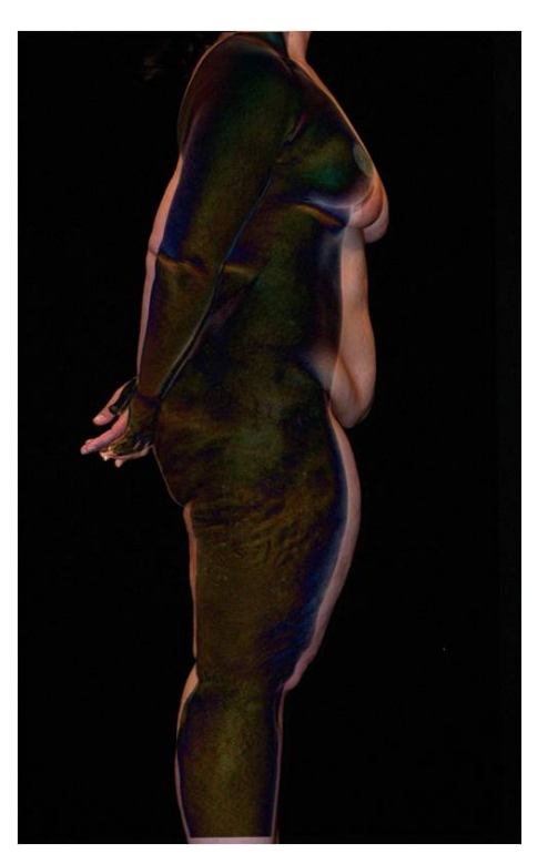
Figure 6. Standardized digital subtraction analysis (preoperative minus postoperative views) of the surgically imposed shape changes following full-body circumferential reproportioning. This surgery was preceded by weight loss of more than 100 pounds, which had reduced the patient's size, but had not achieved the patient's desired shape.

The same standardized imaging techniques can also be used to accurately quantify postsurgery results, because photographic variance has been nearly eliminated. In figure 6, the postoperative result has been digitally subtracted from the preoperative baseline anatomic state, providing evidence of shape change which can actually be measured. The same methods could be used to track disease progression (e.g. Cushing disease or HIV-related lipodystrophy), the effects of therapeutic interventions, or changes in body configuration due to aging.