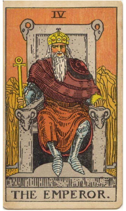
Figure 3. The Emperor tarot card

The Emperor is interpreted as a figure of authority, power, and discipline. His granite throne—sometimes understood as a kind of intellectual throne—emphasizes his fixed state, and he is the embodiment of law and rationality, knowledge, and consciousness. As the Hanged Man is connected to The Emperor, the fates of medical students, too, are connected to those of their mentors. Unlike students in many other graduate educational programs, medical students for the most part do not pave their own paths to discovery. Instead, we rely significantly on others to teach us. We must follow the guidance of our superiors, for they have the knowledge and experience that can transform us into effective clinicians. The aspect of apprenticeship in medical education has been one of medicine's greatest draws in my own choice of career. However, this apprenticeship also feeds into the rigid hierarchy that has become the accepted order in the health care setting.