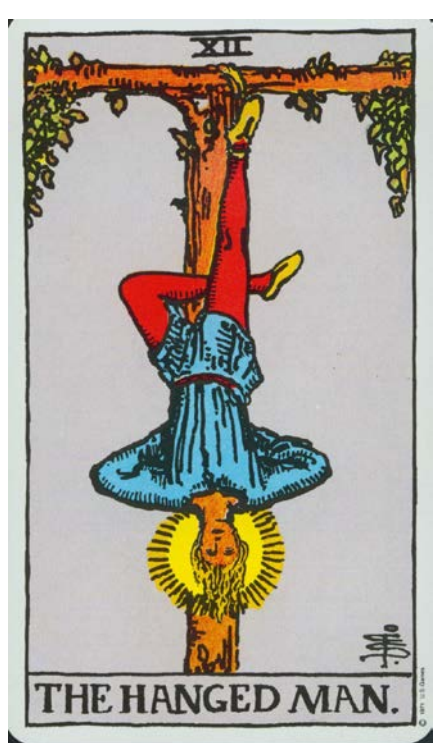
Figure 2. The Hanged Man tarot card

There are several parallels between the tarot figure of the Hanged Man and the student within the institution of medical education.