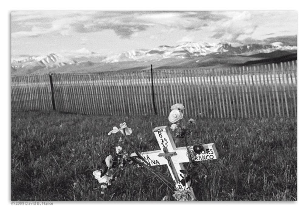
Figure 3. nacio 8 29 75.