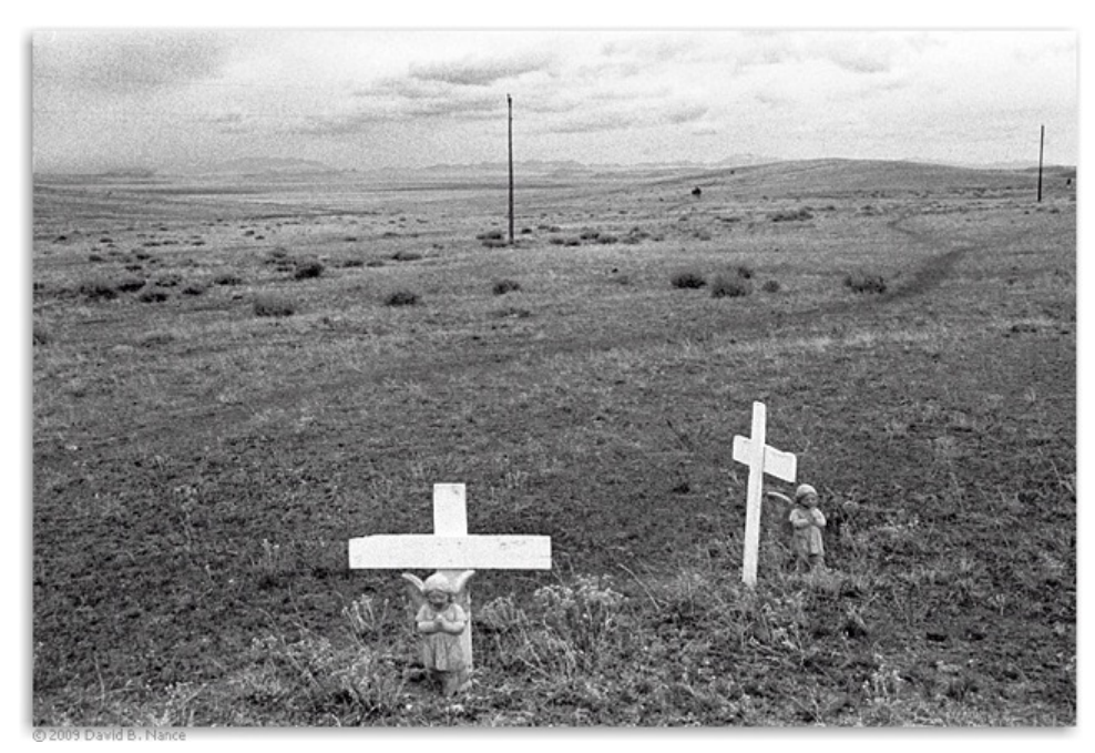
Figure 4. Unmarked.