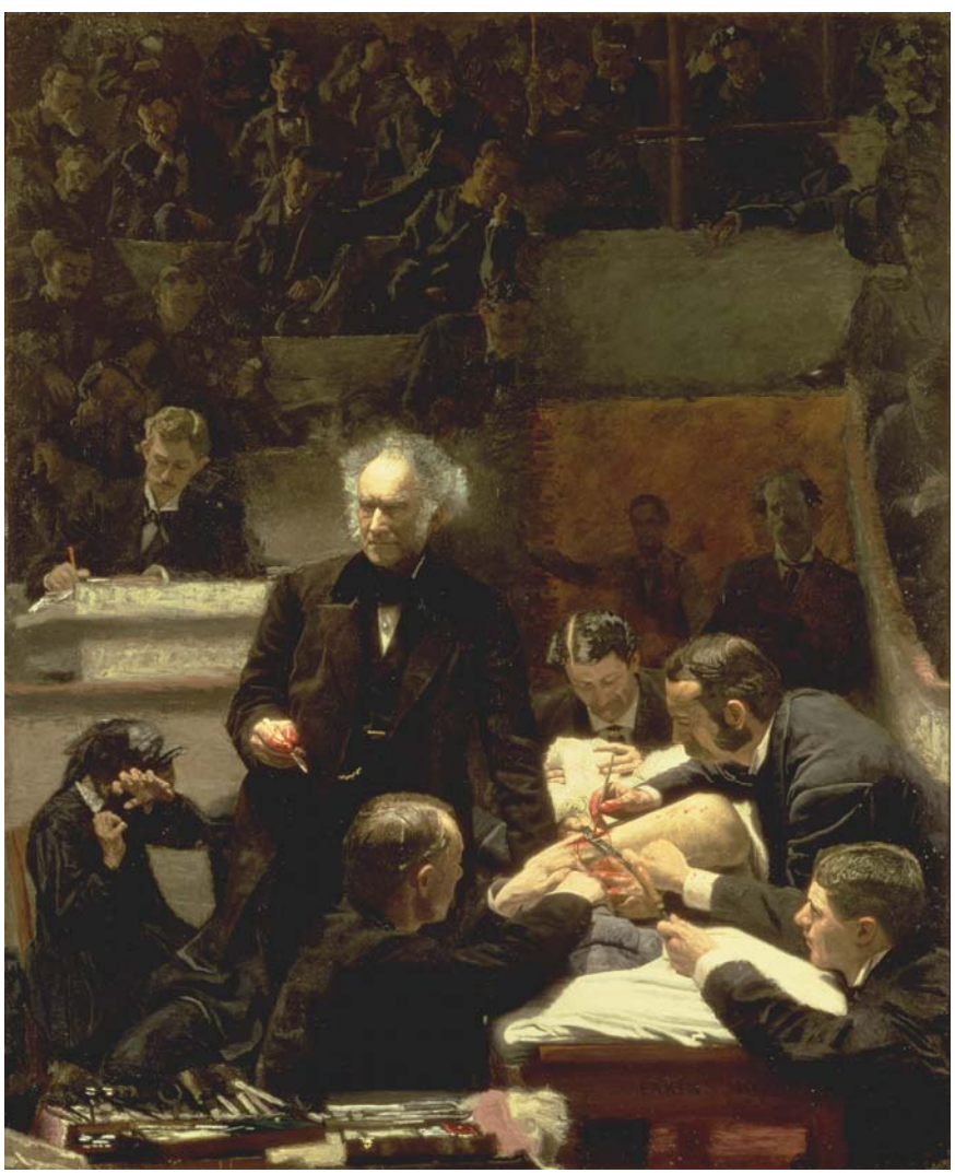
Figure 1 "The Gross Clinic," by Thomas Eakins (1875)