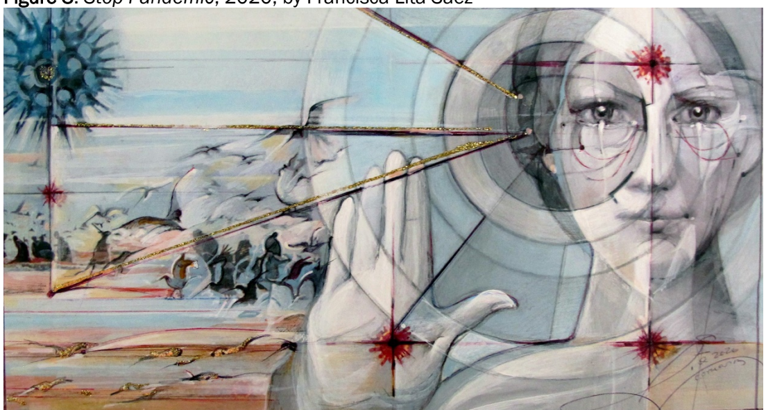
Figure 3. Stop Pandemic, 2020, by Francisca Lita Sáez