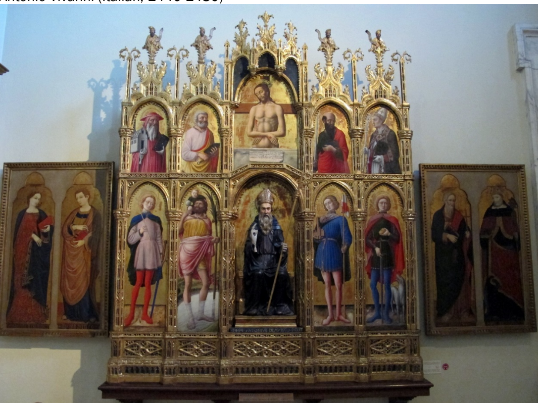
Vatican City: Pinacoteca Vaticana.

Figure 1. Polittico coi ss Antonio Abate, Sebastiano, Cristoforo, Venanzio e Rocco, by Antonio Vivarini (Italian, 1440-1480)