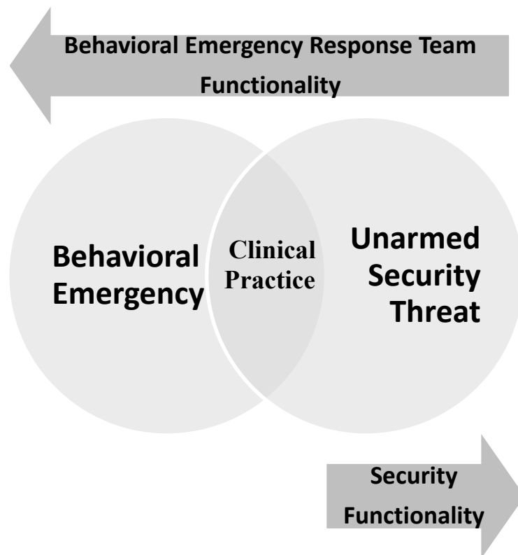
Figure. Shared Features of Clinical Behavioral and Unarmed Security Threats a

The standardized emergency code suggestions of 21 state hospital associations fail to endorse a protocol for general behavioral emergencies that is distinct from security-only protocols. 2 Instead, behavioral emergencies in the United States are frequently equated with safety threats (see Figure). RRTs are called for medical emergencies, yet US clinicians are commonly trained to call a security code when confronted with behavioral crises. These security calls dispatch teams trained to suppress imminent violence rather than promote patient-centered treatment and support. This practice discriminates against people diagnosed with psychiatric disorders and begins a cascade of poor clinical, workplace safety, and financial outcomes. 2