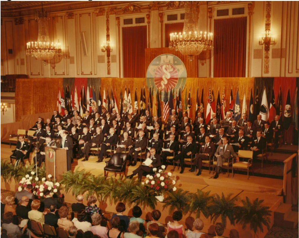
Figure 1. Annual Meeting of the American Medication Association, 1966<sup>a</sup>

credit for physician offices being able to flout requirements of the Civil Rights Act under the guise of protecting professional autonomy.<sup>6</sup>