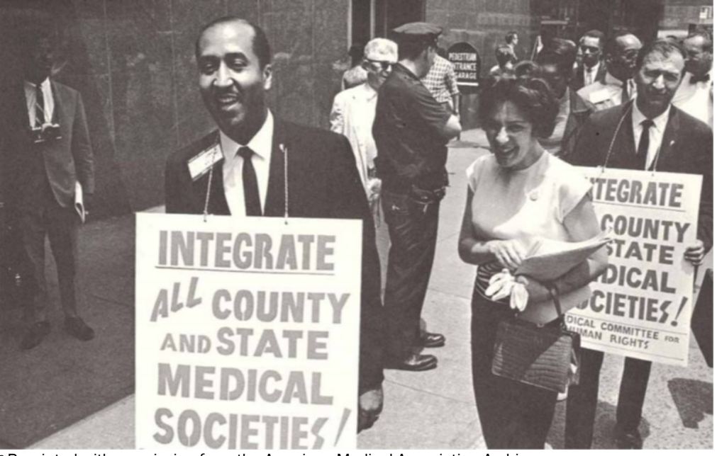
<sup>a</sup> Reprinted with permission from the American Medical Association Archives.

Figure 2. Protestors at the Annual Meeting of the American Medical Association, 1966ª