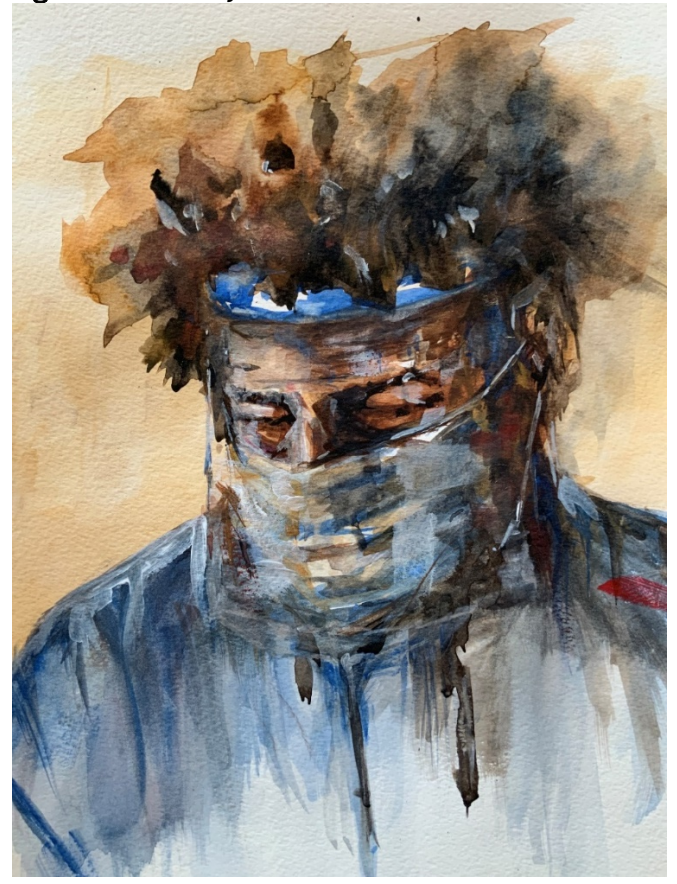
Figure. The Duality of the URM

This watercolor self-portrait visually characterizes an irony faced by clinicians who are underrepresented minorities. Tasked with saving patients' lives during the COVID-19 pandemic, they belong to communities inequitably burdened by the SARS-CoV-2 virus and by many Americans' unwillingness to follow public health recommendations that would protect them, their communities, and their patients.