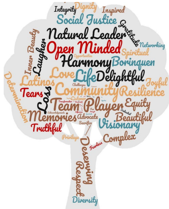
Figure. Descriptions of Community Health Workers in Latinx Communities