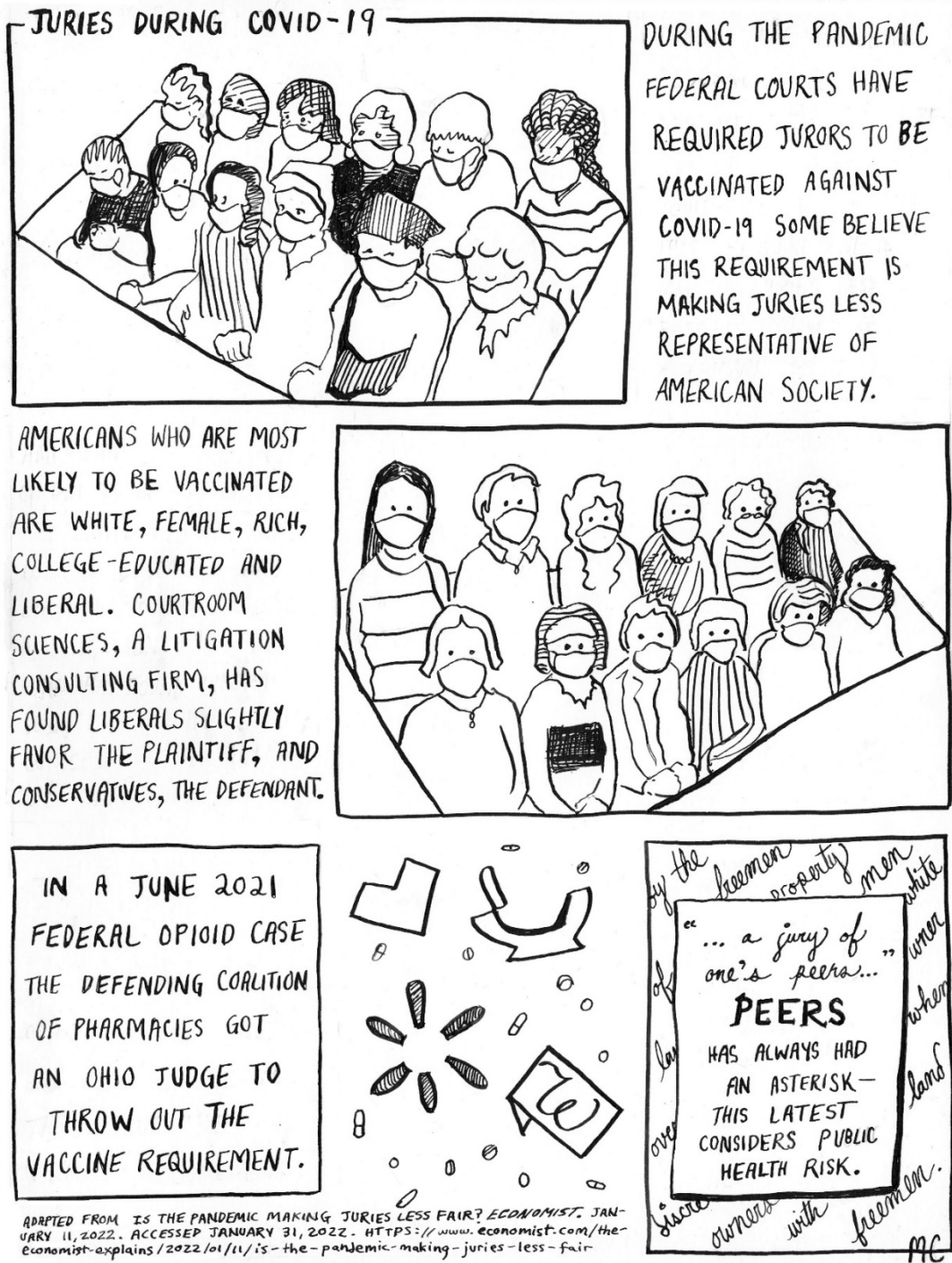
Figure. Juries During COVID-19