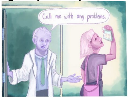
Figure. Mystic Money