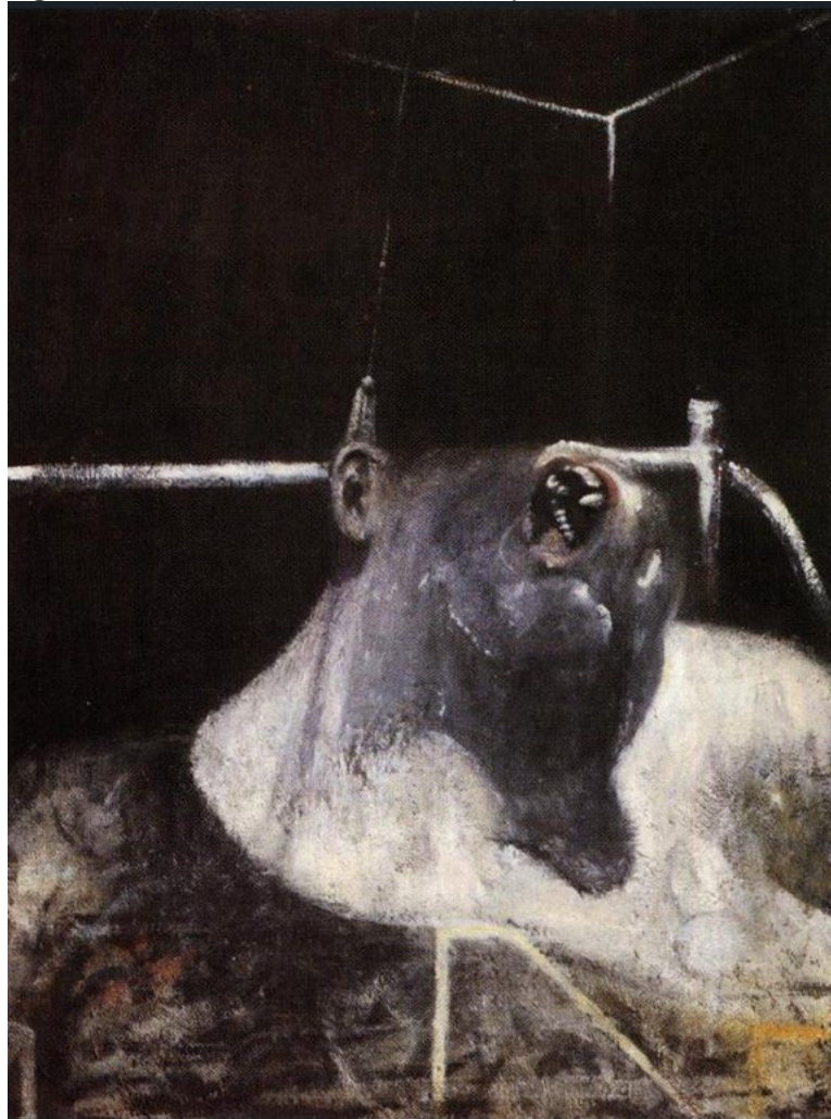
Figure 1. Head 1 , 1948 (CR 48-01), by Francis Bacon