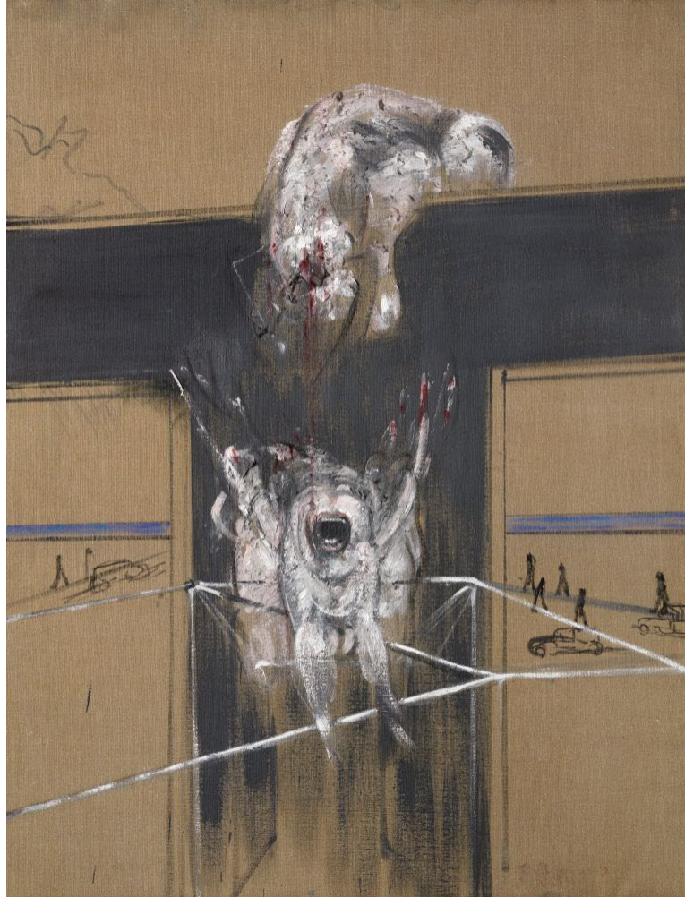
© The Estate of Francis Bacon. All rights reserved. DACS, London/Artists Rights Society, New York 2022.