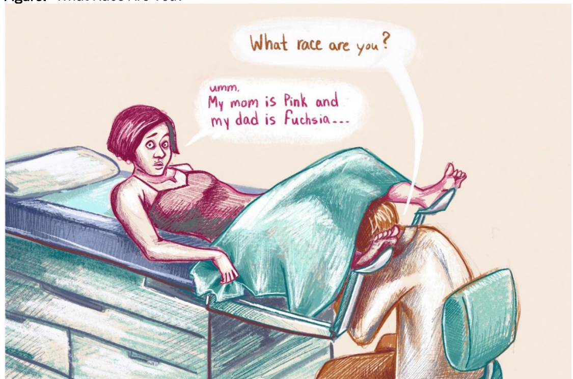
Figure. “What Race Are You?”

This comic shares a true story of a physician’s fraught interaction with and examination of a patient and prompts consideration of how context, empathy, and emotional intelligence play key roles in how well patient-physician conversation is likely to go in the moment and when replayed by a patient after an awkward, uncomfortable encounter.