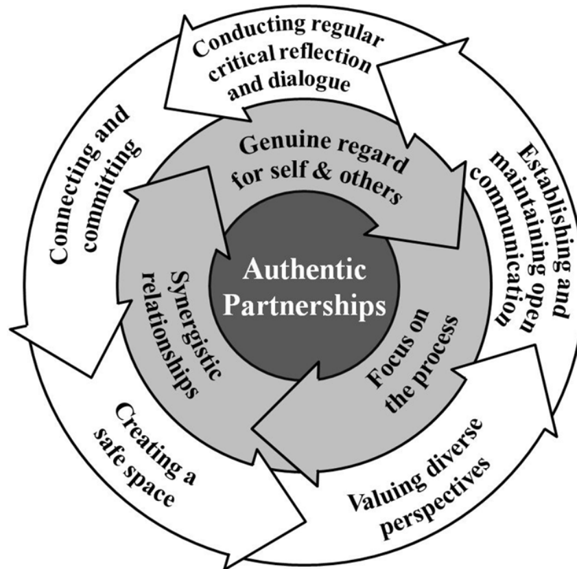
Figure 1. A model of authentic partnerships. From Dupuis SL, Gillies J, Carson J, Whyte C, Genoe R, Loiselle L, Sadler L. Moving beyond patient and client approaches: mobilizing "authentic partnerships" in dementia care, support and services. Dementia (London) . 2012;11(4):427-452. Copyright © 2012 by The Author(s). Reprinted by permission of Sage Publications, Ltd.

When care partners work in partnership with persons living with dementia, they do more than just protect personhood; they mobilize social citizenship (meaning preserving the same civic and social rights and opportunities afforded to all citizens) by supporting people living with dementia in making contributions to civic dialogue and activities, and thus new possibilities emerge for living well [27].