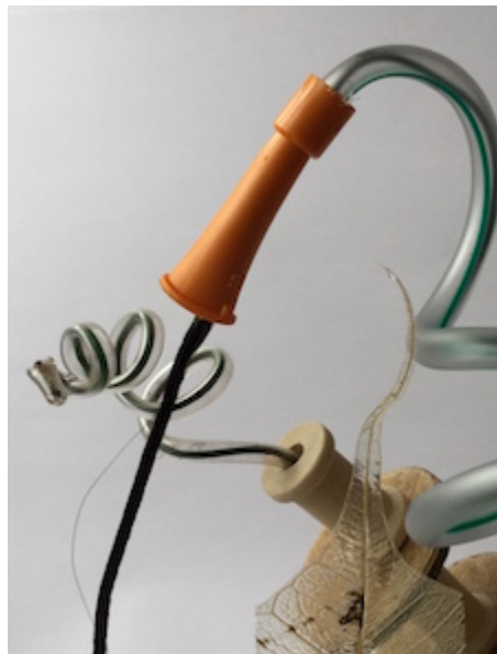
Figure 5. Series Four 06:16:02 , by Louise O'Boyle