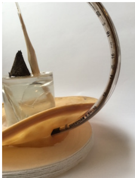
Figure 3. Series One 06:16:03 , by Louise O'Boyle