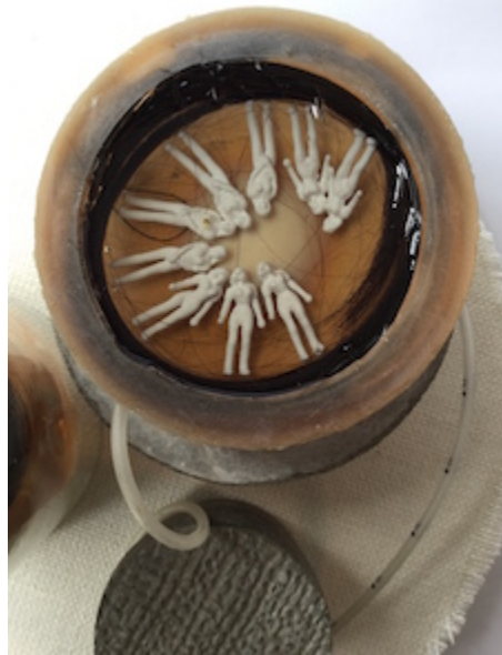
Figure 1. Series Three 06:16:02 , by Louise O'Boyle