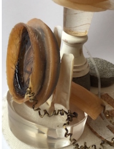
Figure 12. Series Four 06:16:03 , by Louise O'Boyle