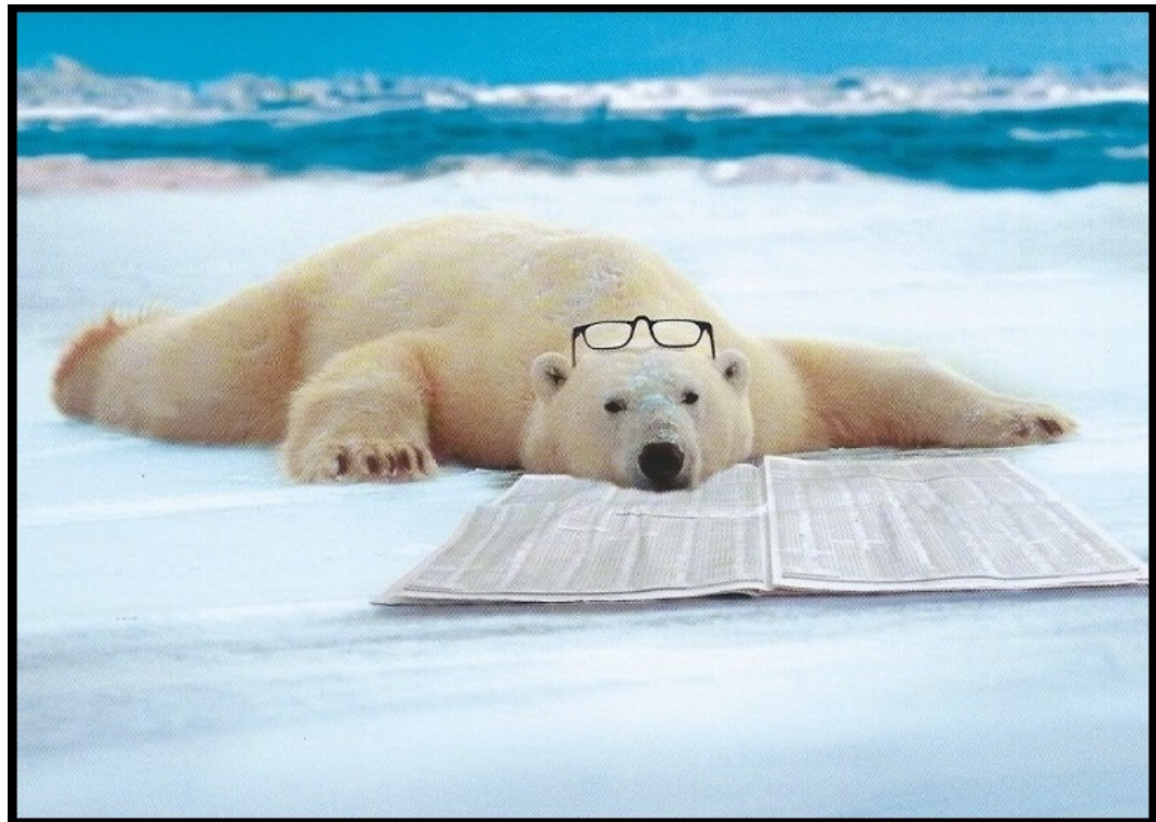
Figure 3. Polar bear Father's Day greeting card.