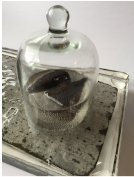
Figure 18. Series Three 06:16:03 , by Louise O'Boyle