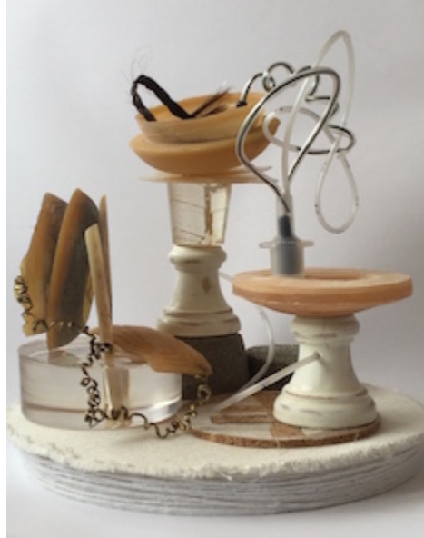
Figure 10. Series Four 06:16:03 , by Louise O'Boyle