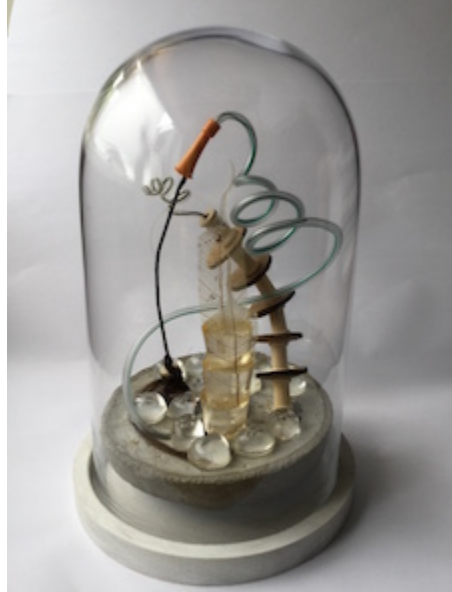
Figure 4. Series Four 06:16:02 , by Louise O'Boyle