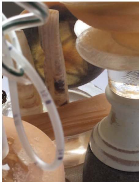
Figure 11. Series Four 06:16:03 , by Louise O'Boyle