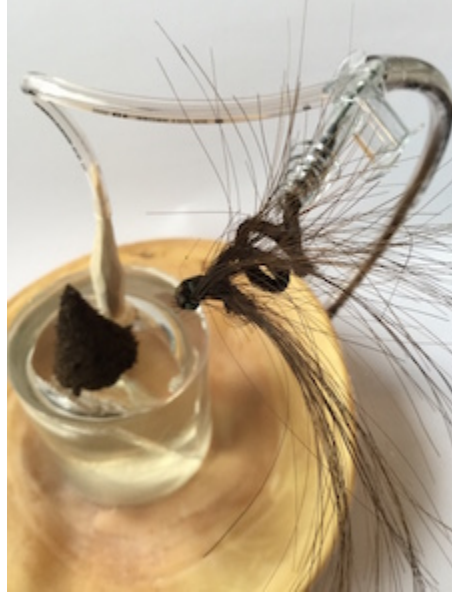
Figure 2. Series One 06:16:03 , by Louise O'Boyle