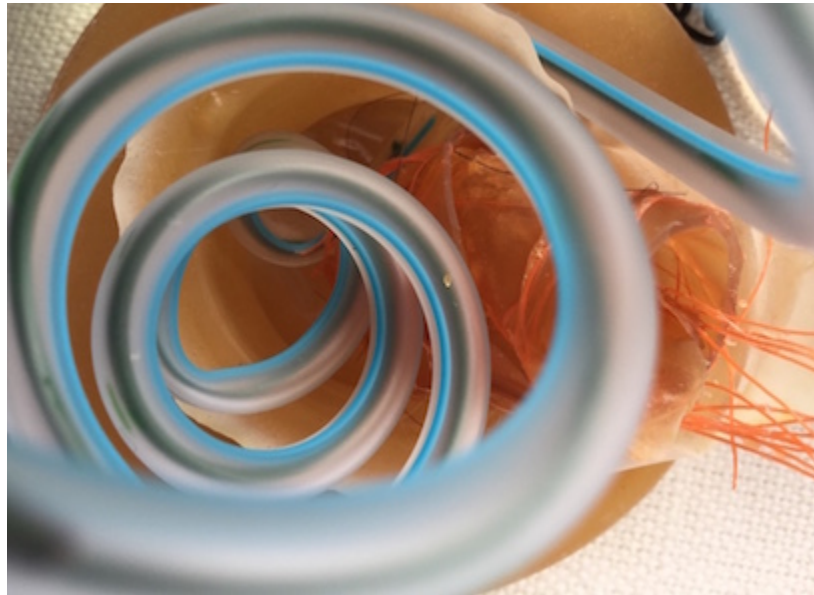
Figure 16. Series Two 06:16:02 , by Louise O'Boyle