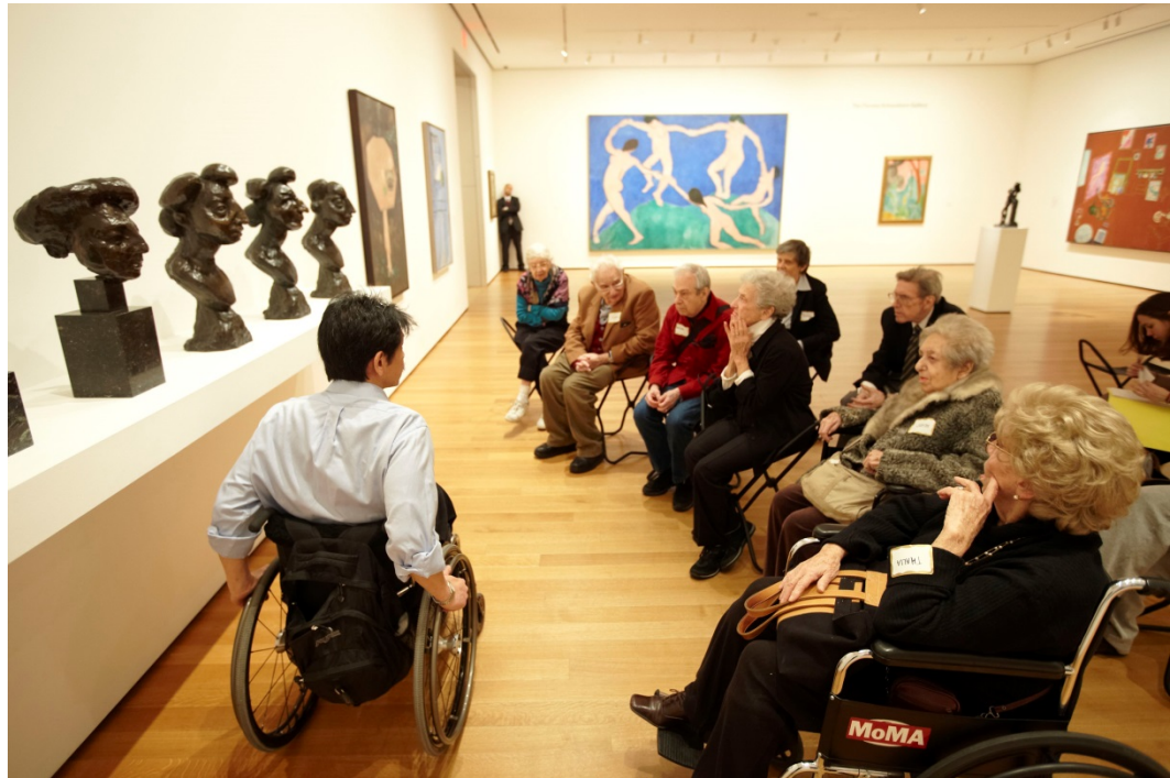
Figure 2. Photograph of the Meet Me at MoMA program.

TimeSlips, founded by MacArthur Fellow Anne Basting, is a creative project that engages groups of people with dementia through storytelling [18]. Online training information enables caregivers to support meaningful exchanges. Each group session is led by a TimeSlips facilitator, who leads the group as it explores a large photograph featuring images intended to encourage storytelling, such as a black and white photo of a baby in a leather handbag, a photo of a person holding a large frog, or a photo of people playing in the rain. As the participants comment on their observations about the photo, a second person documents the remarks and, together with the facilitator, they create a story about the photo. Imagination rules and memories are sparked. No comments made by the participants are excluded. Caregivers and care partners laugh and enjoy the moments of interaction, each beyond the grasp of the progressing disease. Stories can then be submitted to the TimeSlips website, which is building an online community of people with dementia and their caregivers [19]. TimeSlips has made a profound change in person-centered care for people with dementia, expressing respect for their dignity by including their contributions and stories and offering opportunities for them to share their life experiences in ways that honor and accept their present selves without comparison to their prior selves.