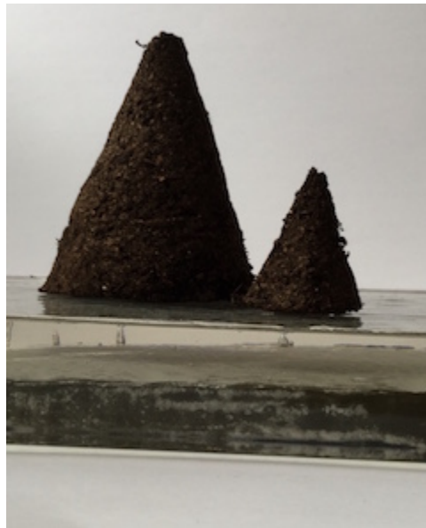
Figure 19. Series Three 06:16:03 , by Louise O'Boyle