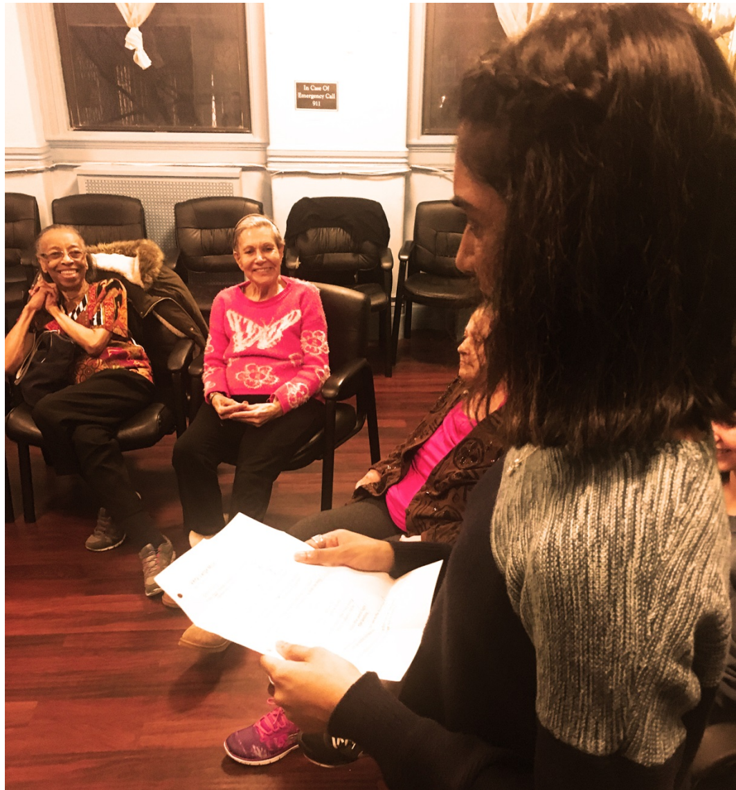
Figure 1. Poetry for Life with Brooklyn Technical High School students at New York Memory Center.

Meet Me at MoMA is a museum-based program of the MoMA Alzheimer's Project within the Museum of Modern Art (MoMA) in New York City [16]. Developed by MoMA's education department, this innovative program takes advantage of the museum's quiet times to bring together trained museum educators and people with dementia and their caregivers to explore great works of art, such as Vincent van Gogh's Starry Night , from their collection. Participants engage with their imaginations in a limitless world, interpreting what the art means to them in that moment. Observers might not be able to distinguish between the caregivers and their care partners, as all are engaged in meaningful conversations about each piece of artwork presented (see figure 2). MoMA also developed evidence-based training modules to disseminate this model to museums across the country [17].