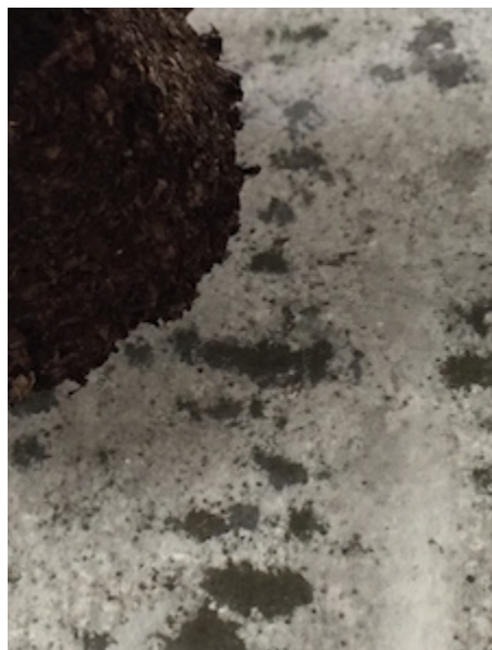
Figure 17. Series Three 06:16:03 , by Louise O'Boyle

This artwork explores the cyclical nature of living through dying as experienced by the patient.