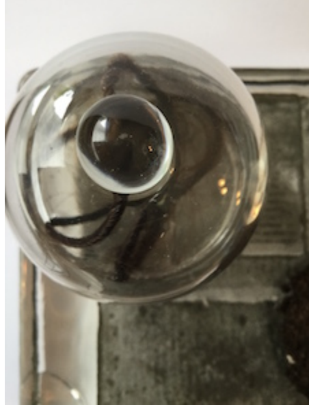
Figure 8. Series Three 06:16:01 , by Louise O'Boyle