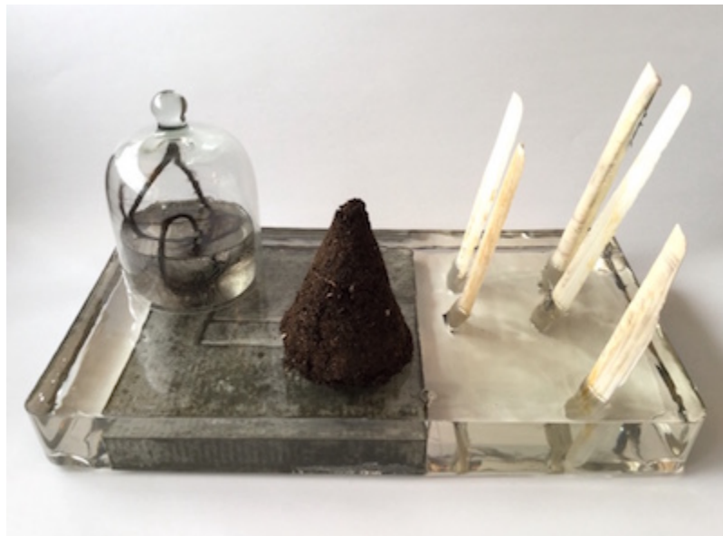
Figure 7. Series Three 06:16:01 , by Louise O'Boyle

This artwork physically manifests the patient's experience of being at the end of life.