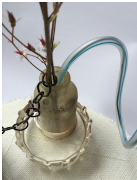
Figure 13. Series Two 06:16:01 , by Louise O'Boyle

This artwork explores the balance of interconnecting elements within and around the body—their connection to medical treatments and the physical manifestation of the patient's experience in sculptural form.