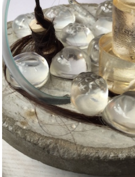
Figure 6. Series Four 06:16:02 , by Louise O'Boyle