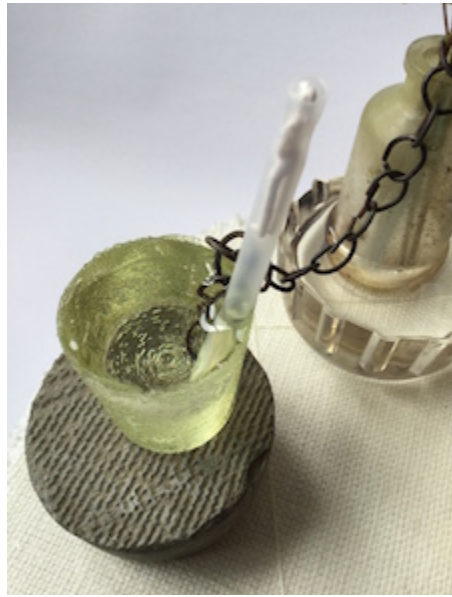
Figure 14. Series Two 06:16:01 , by Louise O'Boyle