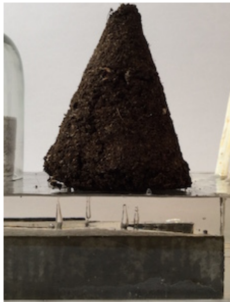
Figure 9. Series Three 06:16:01 , by Louise O'Boyle