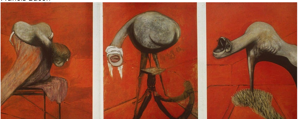
Figure 3. Three Studies for Figures at the Base of a Crucifixion (CR 44-01), 1944, by Francis Bacon