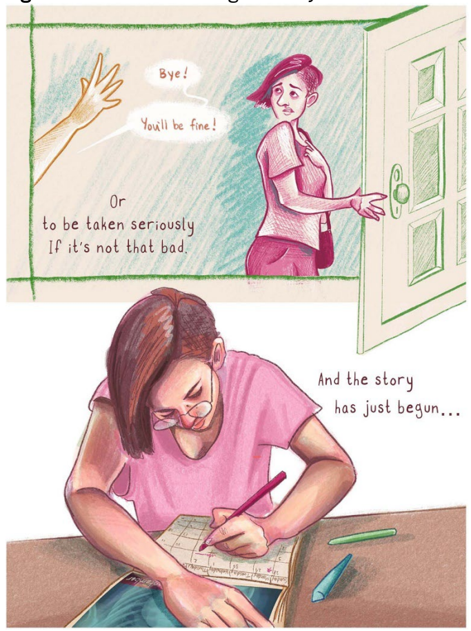
Figure . Detail from Reading the Busy Calendar of a Busy Body

(Click here to view the entire graphic narrative.)