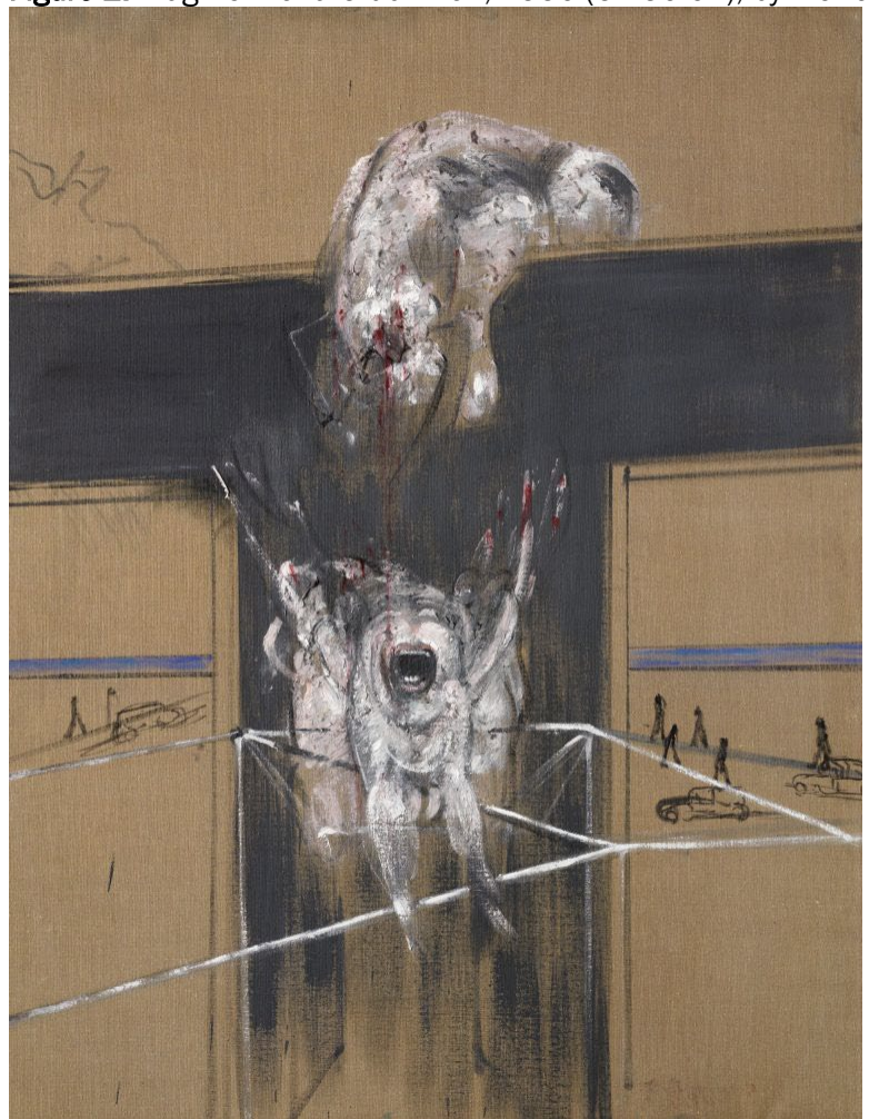
Figure 2. Fragment of a Crucifixion, 1950 (CR 50-02), by Francis Bacon

© The Estate of Francis Bacon. All rights reserved. DACS, London/Artists Rights Society, New York 2022.